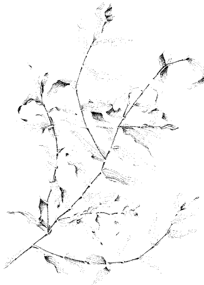
Clasp- ing pondweed

New York Sea Grant 10 Westbrook Lane Kingston, NY 12401-3824 Tel: (845) 340-3983 Fax: (845) 340-3993 www.seagrant.sunysb.edu