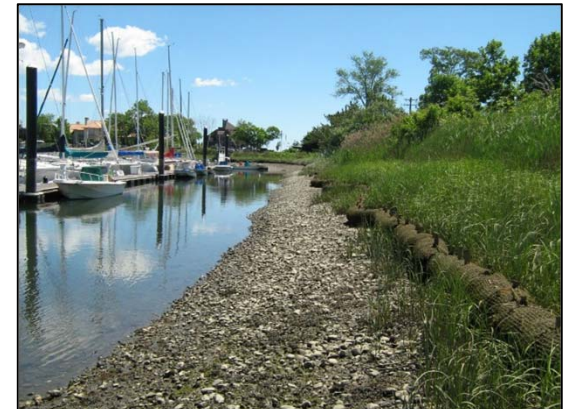
COWI North America